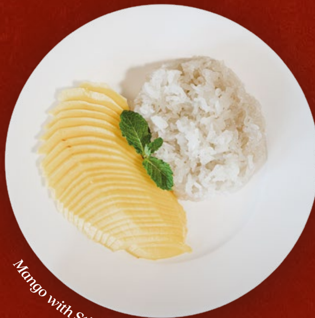
Mango with Sticky Rice