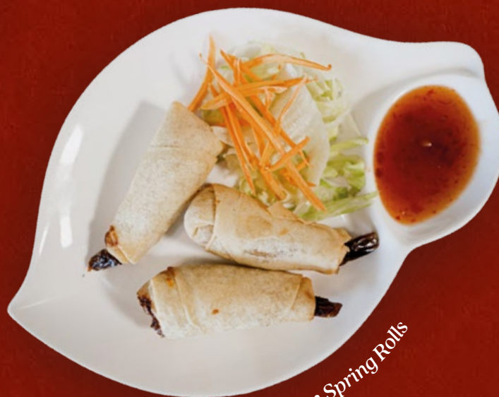
Prawn Spring Rolls