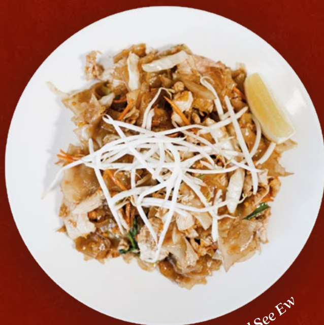
Pad See Ew