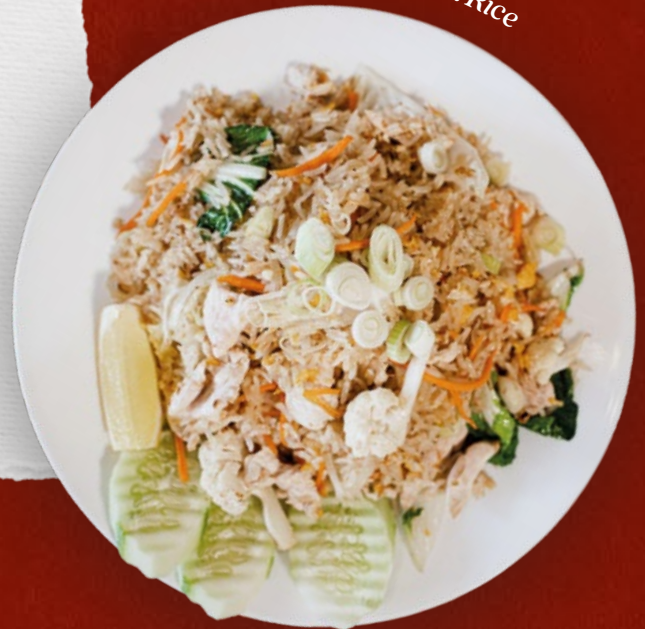
Thai Fried Rice

Steamed Jasmine Rice Small... $3.50 Large... $5