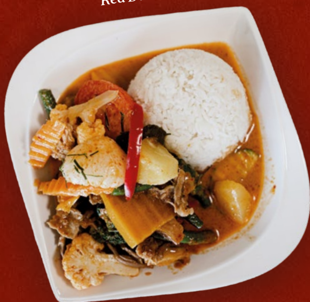
Red Duck Curry