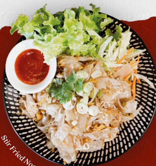
Stir Fried Noodles

Thick rice noodles stir fried in sweet soy sauce with egg, carrot, wombok, shallots and sprouts.