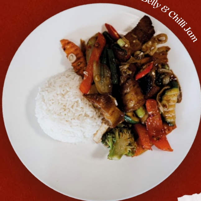
Pork Belly & Chilli Jam

All stir fries come with Jasmine Rice. Change to Coconut Rice ... $2 No rice ... $2