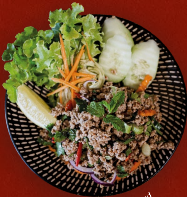
Thai Pork Salad