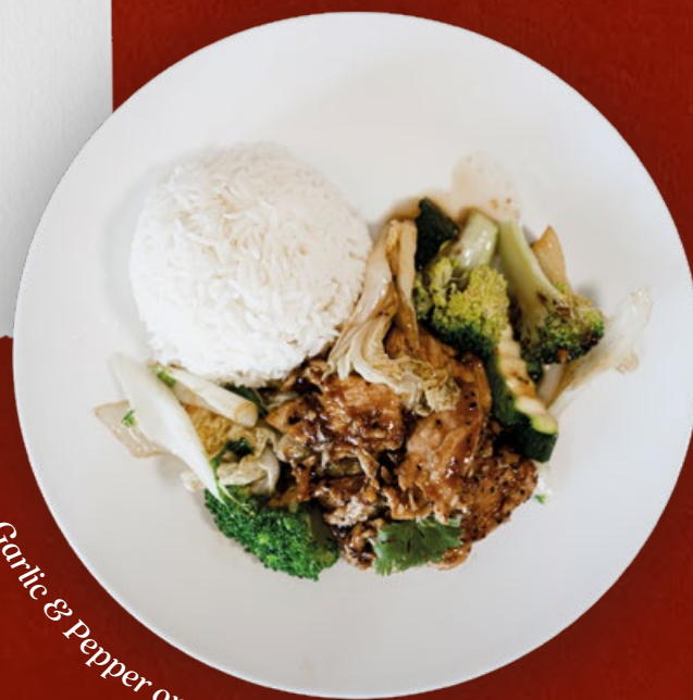
Garlic & Pepper on Green