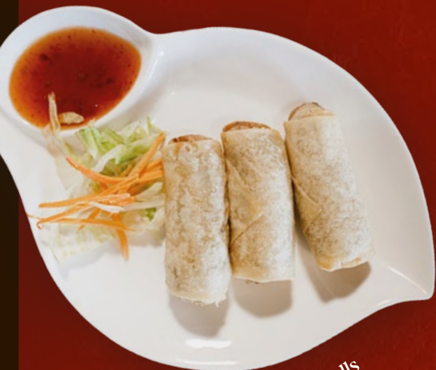
Veggie Spring Rolls